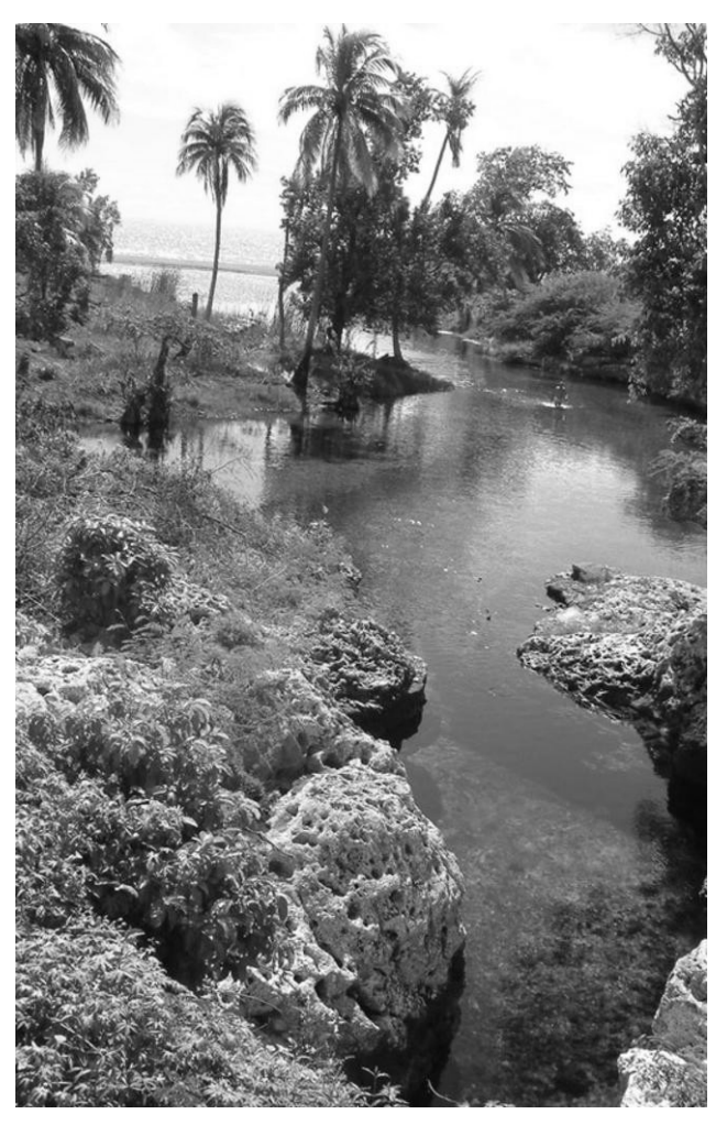
Love yourself! You are who you have been given to experience LIFE.