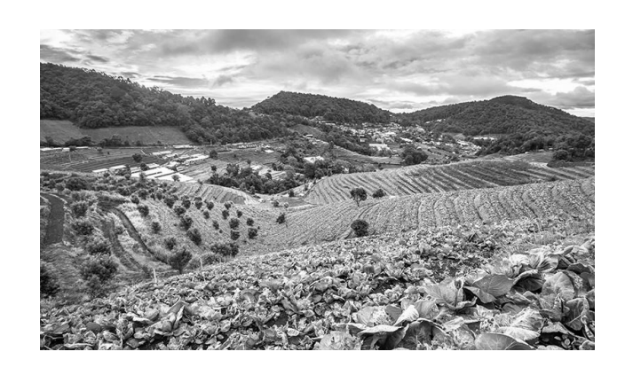
Wealth is what all living creatures inherit at birth and take with them beyond the grave.