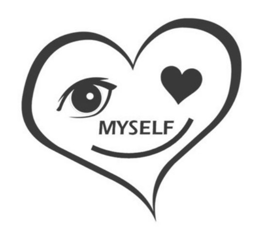
Vision is seeing that sincerity is better than popularity.