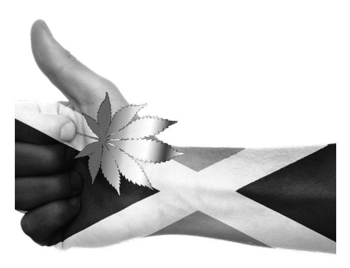
www.reverenceforlifeuniversity.com Eye Am a Cosmic Citizen