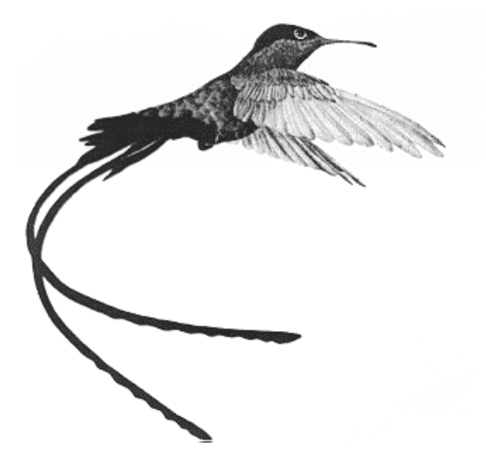
Be as playful as birds in the sky and fishes in the sea, spread your wings and fly.