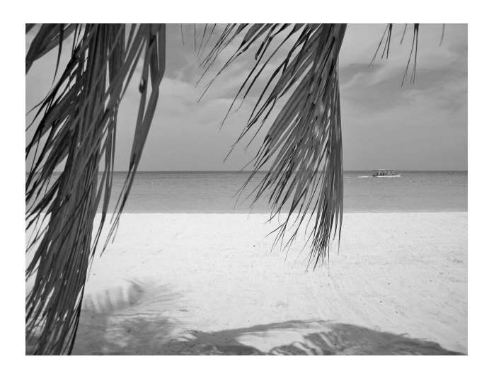
LIFE IS JUST FOR LIVING. IF YOU MISS THIS, YOU HAVE MISSED YOUR MEANING.