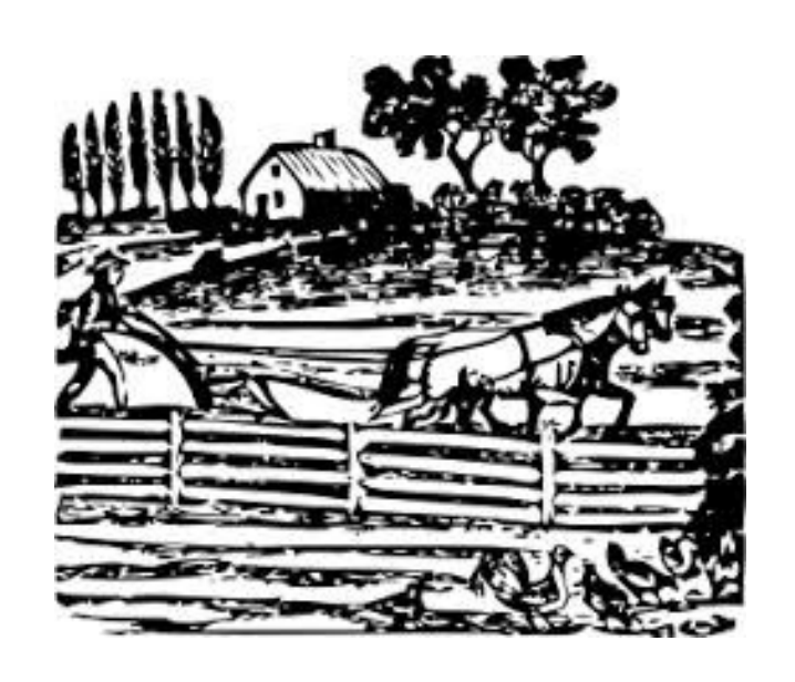
Cannabis farming can be a profitable business