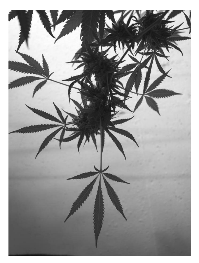
Ganja tga curgd My Dgngug Fgygr.