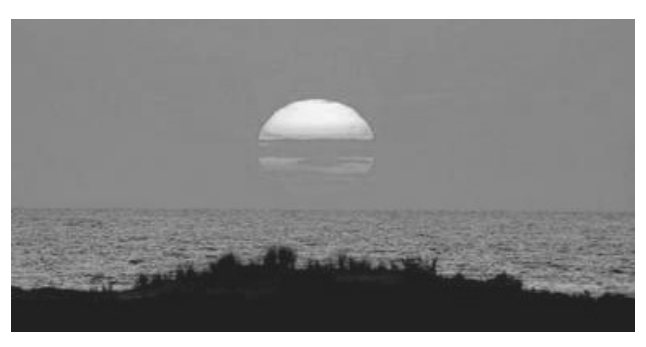
Eye Am a Cosmic Citizen

Every conscious deep breath enhances my health. My breath is my God, my truth, my security and my reality.